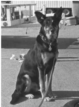
The pooch who had to sit in the middle.