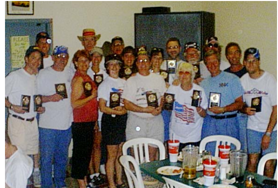
Winners and Spoils: Some of Reno's reapers pose at the Hawthorne Pizza Factory post-event prizegiving.