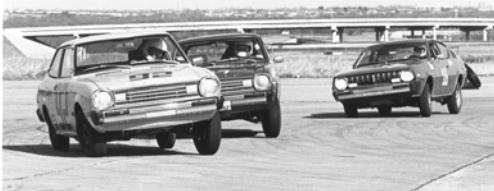
The subject of our tale, in a happier moment.

The last week of May, he packed the little Colt to overflowing with camping gear, tires, tools (he at least bought a roof rack), and, oh yes, luggage and dog food. Did I tell you he was taking his girl friend and his German Shepherd?